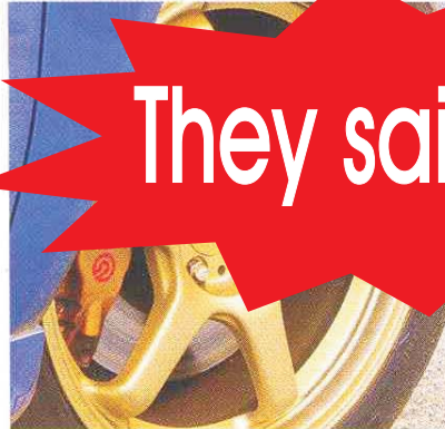
Prodrive GC 010 wheels are gorgeous, light (16.5 pounds) and presumably very strong. The 43mm offset is 10mm outboard of the stock wheels, though, which causes torque steer and tire clearance issues.

shipped to Fuji Heavy Industries. The two power steering lines that run below the bushing make installation difficult. We found it easiest to just use a bit of brute force to bend the lines out of the way for a few minutes, then bend them back when we're done.