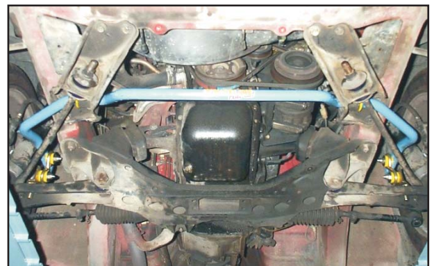
Photo 2. BTF35Z complete assembly

Warning: Please drive carefully while you accustom yourself to the changed vehicle behaviour.