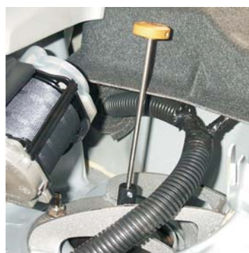
Rate adjuster extension kit

WARNING: Group 4 mount bracket is of an extra heavy duty design however we discourage modification or elongation of clevis bracket mounting holes for camber adjustment. This process will weaken ANY strut mount bracket that can result in adjustment mount slip and premature bracket failure. Use alternate means to adjust camber.