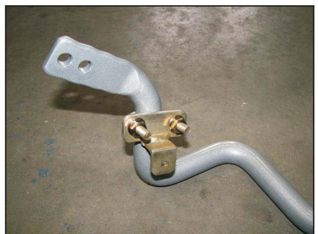
Photo 2. Whiteline Swaybar ride height sensor mounting bracket

Warning: Please drive carefully while you accustom yourself to the changed vehicle behaviour.