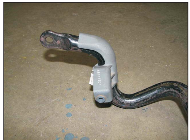
Photo 1. OEM Swaybar ride height sensor mounting bracket