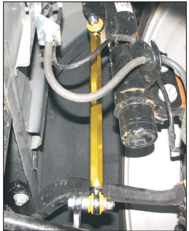
Photo 2. KLC064 - complete assembly