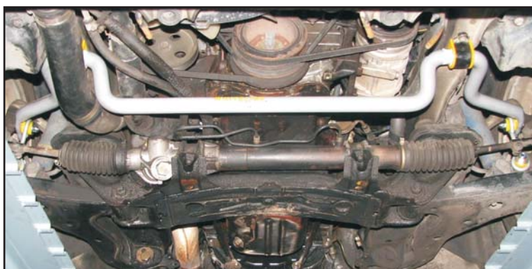
Photo 5. BTF39Z complete assembly

Warning: Please drive carefully while you accustom yourself to the changed vehicle behaviour.