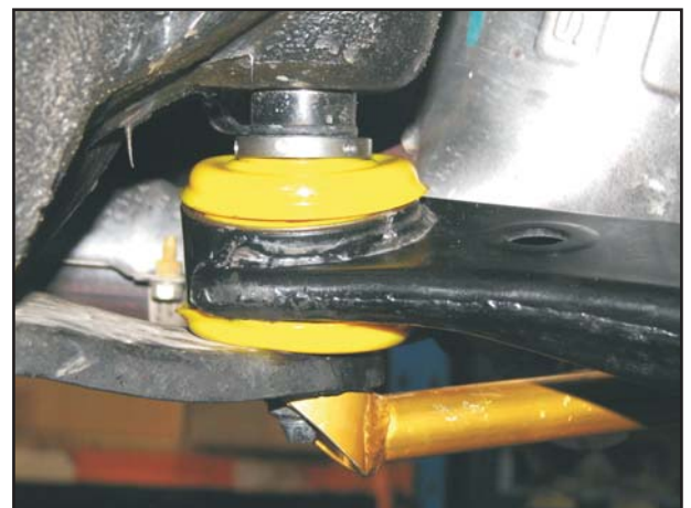
Fig 3 - right-hand control arm, outside view.

Warning: Please drive carefully while you accustom yourself to the changed vehicle behaviour.