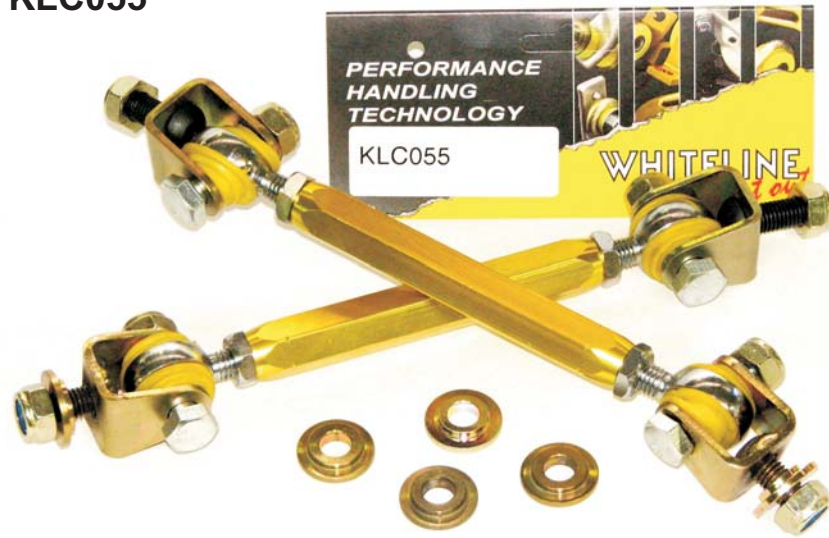
Suit Commodore VN-VT '86-'00